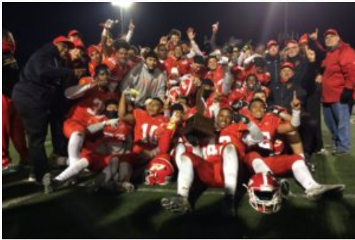
Football: CIF State Championship Roundup (12/17/16)