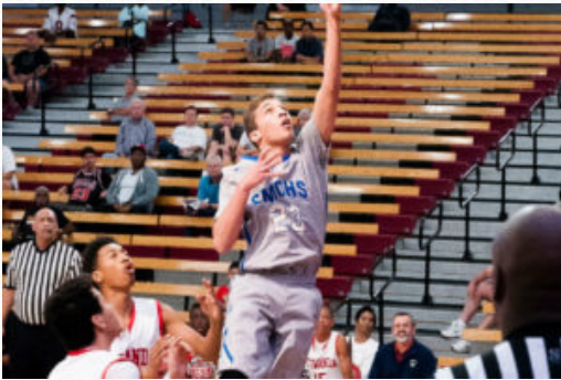
Boys Hoops: So Cal Sidelines Top 20 (12/19/16)

← Previous Story Boys Hoops: So Cal Sidelines Top 20 (12/19/16)