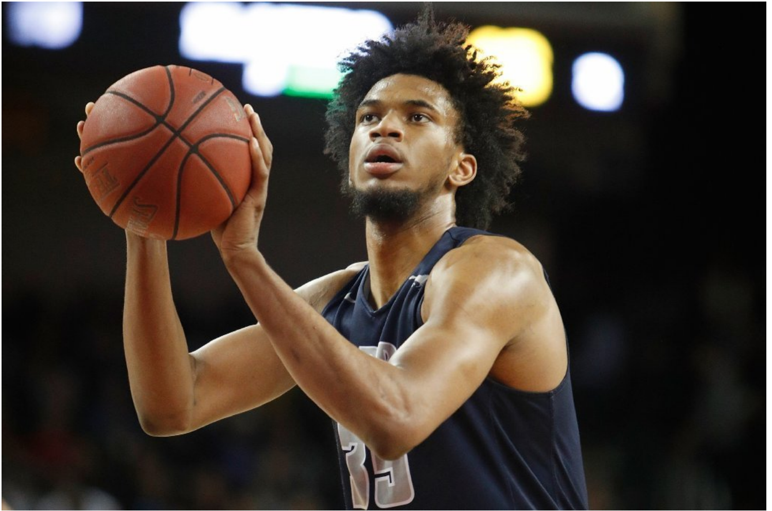
Marvin Bagley III

It was an extraordinary season for individual basketball talent in Southern California.