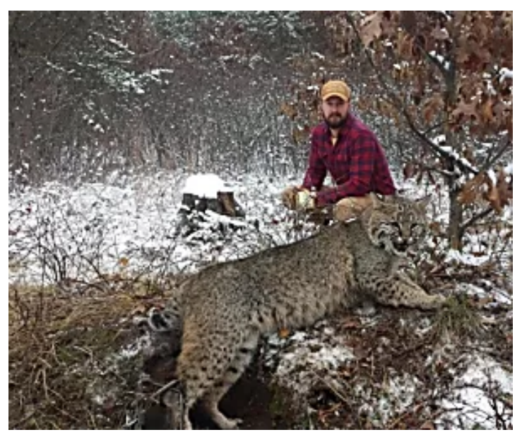
A Man In Wisconsin Discovers A Vicious Animal In The Woods Near His Home! [Gallery] Nocartridge